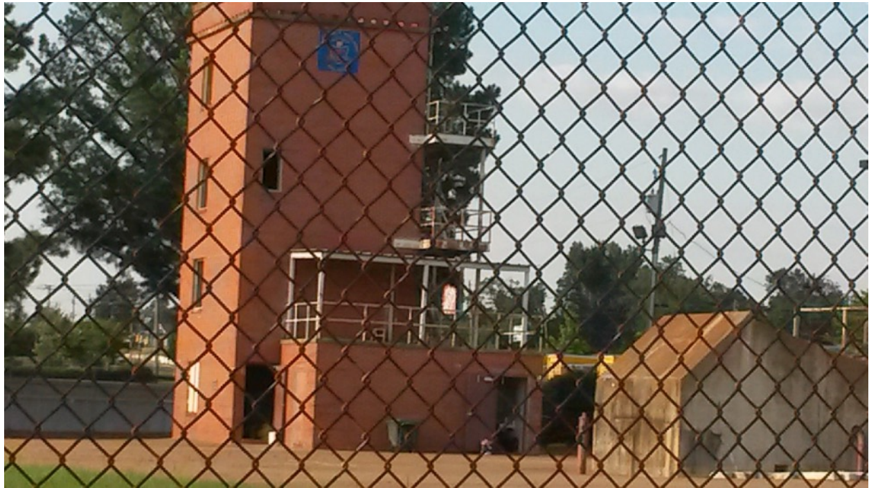
This is the location of the old Alabama Fire College, where I received training to become a firefighter in Alabama.