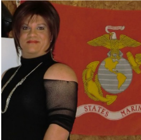
This is simply a picture of me with the Marine Corps Flag.