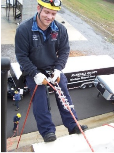
This is me preparing to repel off a training tower, which was approximately 60 feet. This was while taking the Alabama Fire College Rescue Technician: Rope