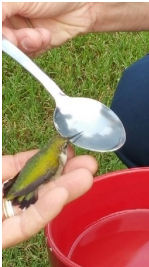
This is a unique story, a hummingbird got trapped in the fire apparatus bay and became weak. I could not stand it, so I went and mixed up some sugar water and hand fed it until it gained its strength back and was able to fly off.