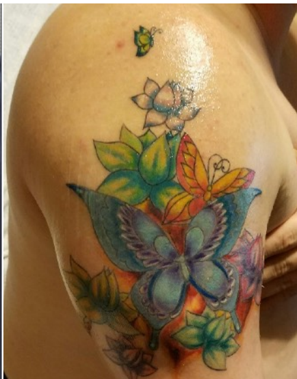
This is a great example of making mistakes at a young age, because your family tells you what to think and that you are a boy when you know that you are a girl.